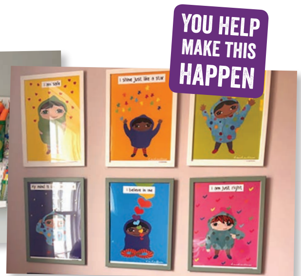
The colourful walls and inviting cosy space offer relief and comfort to a child who feels overwhelmed